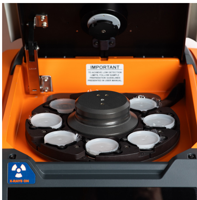
Figure 2. 8-position Autosampler Configuration