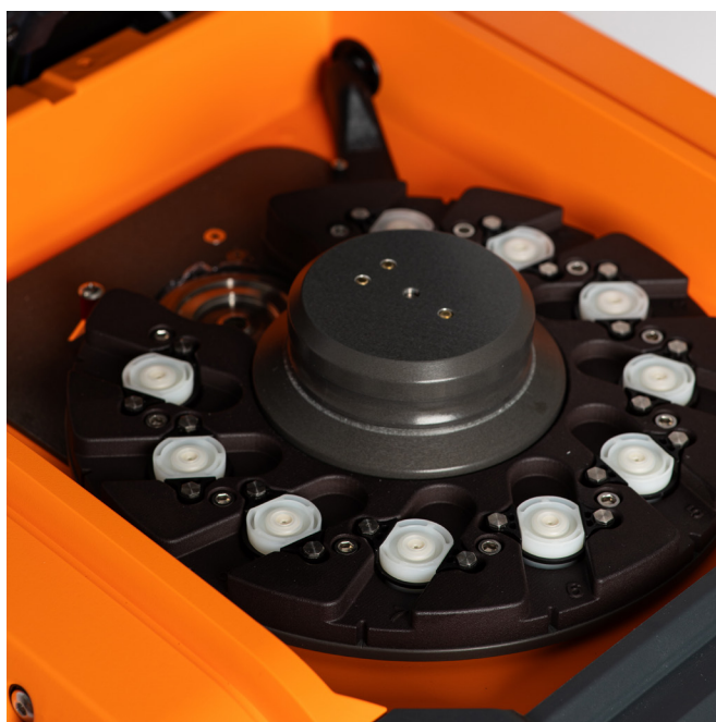
Figure 1. 10-position Autosampler Configuration 1

Previously limited to Accucells sample cups, the R Series autosampler is available with a 10-position Accucells configuration 1 or 8-position standard (Chemplex) cup configuration (Figures 1 & 2). The Accucells configuration uses pre-assembled, pre-vented sample cups making sample prep mess-free and hassle-free—it's perfect for the lab manager looking to make their process as optimal as possible. For users not ready to adopt Accucells, the standard cup version is also available and may be preferred for viscous samples where pipetting the sample is difficult.