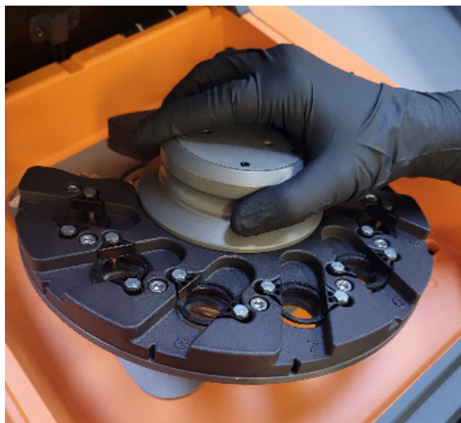
Figure 3. Autosampler Tray Removal

Figure 4 shows the measure screen for the new R Clora autosampler. Touch the position number buttons (numbered circles in Figure 4) to enter/review the measurement parameters for each position. Now, the user has more freedom to customize each measurement position. With this freedom comes responsibility (see “Using These Settings Responsibly” on Page 6). In the meantime, let’s look at each of the settings in more detail.